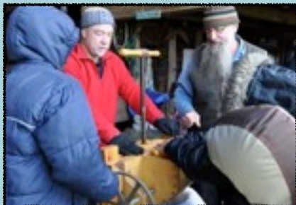
PRESSING FARM PICKED APPLES INTO CIDER. THE CIDER WAS DELICIOUS AND A HUGE HIT WITH THE KIDS