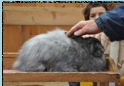
ANGORA RABBIT WHOSE HAIR IS USED FOR SPINNING INTO YARN AND KNITTING.